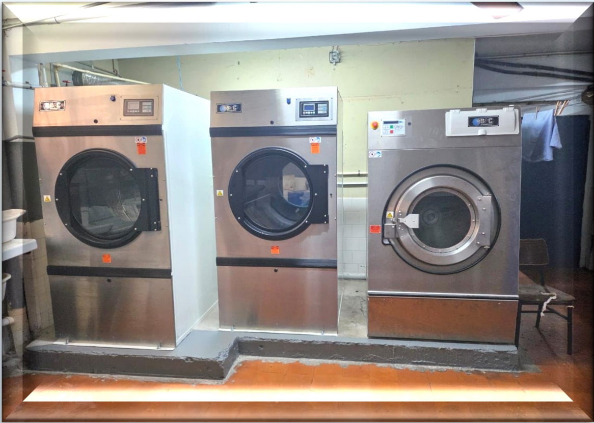
Photo of two dryers and one washer installed at the Victoria Jubilee Hospital

A significant investment of JA$10 million JMD has been made in the Kingston Public and Victoria Jubilee Hospitals (KPH/VJH) laundry services for emergency cases; marked by the installation and commissioning of two state-of-the-art washers and two dryers inside the linen room at Victoria Jubilee Hospital. This upgrade is part of our ongoing commitment to enhancing operational efficiency and service quality.