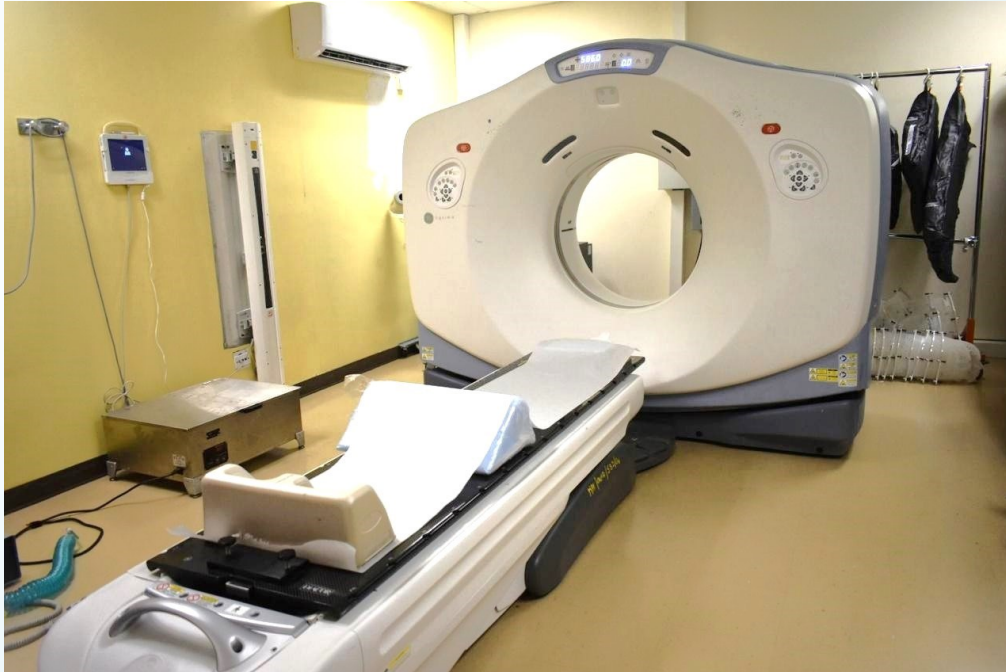
Clinica- Varian Linear Accelerator, which provides treatment by utilizing external beam radiation.

More than 54,000 patients with cancer at the St. Joseph's Hospital (SJH) have been treated since 2018 using its state-of-the-art Clinica Varian Linear Accelerator (Linac). This advanced external beam radiation therapy system, purchased by the Ministry of Health and Wellness (MOHW) at a cost of USD 4.8 million, employs innovative techniques such as 3D Conformal and Intensity Modulated Radiotherapy (IMRT).